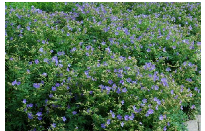
Pictures above: A seasonal sequence showing tulip 'Scarlet Baby' and Geranium walliachianum 'Buxton's Blue' interplanted in Guelph, Ontario.