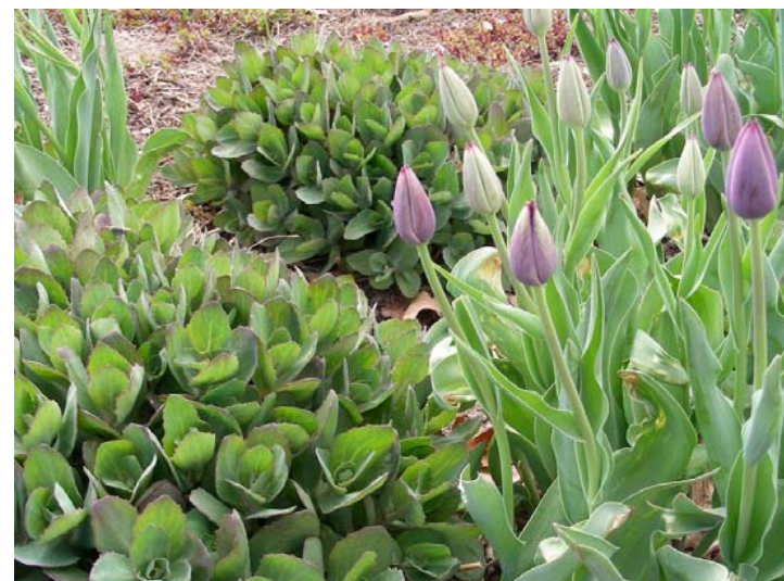
Picture above: An example of a "color echo" of purplish 'Queen of Night' tulip with the dark leaf edges of Sedum 'Matrona'. In this case, the color echo is between a flower and a leaf.

http://www.hort.cornell.edu/greenhouse/pestsdis/Flo ristGuidelines06.html