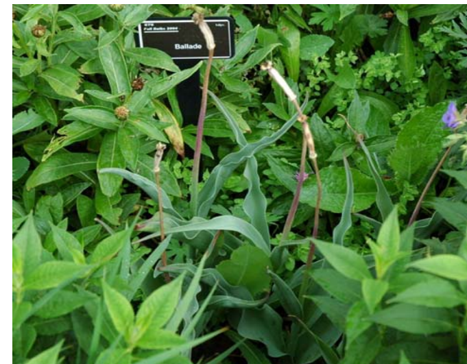
Above: Two views during the season of tulip 'Ballade' and Helenium autumnale interplanted in Guelph, Ontario. An excellent example of a functional companion planting.